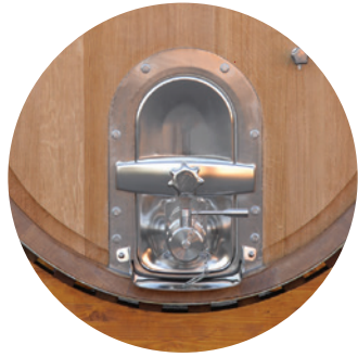
Stainless steel door (standard)