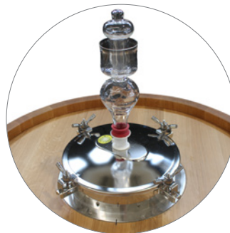
Stainless steel lid for Vats