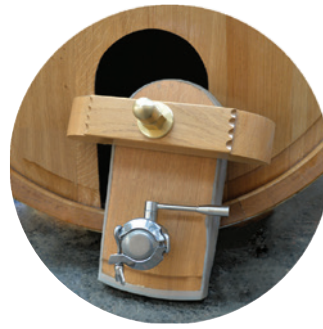
Wood door with silicon gasket