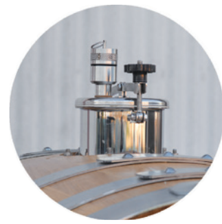
Stainless steel lid