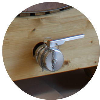
Total drainage pipe in stainless steel