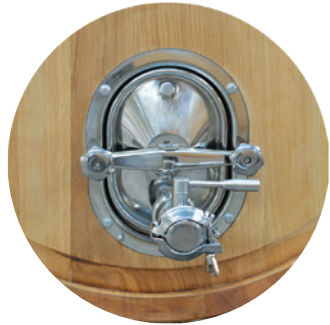
Stainless steel door for SPEZIAL FASS